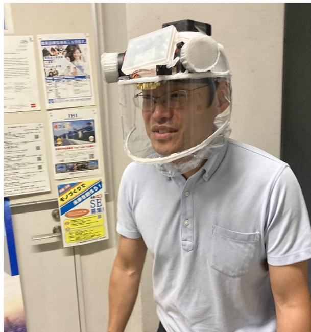
Figure 2. The 4th prototype of “Distancing-Free Mask”